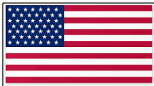
49-star flag (7 rows, 7 stars in each row)

So they bought a 49-star flag as soon as it became available and, shortly thereafter, the 50-star version: