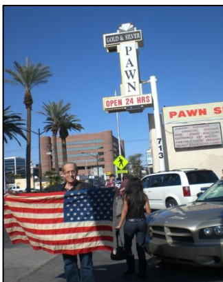
Me and my 49-star flag in front of Gold & Silver Pawn, Las Vegas

Fast-forward to 2009. One of most popular cable television shows was (and is) Pawn Stars . It airs weekly on the History Channel and is viewed around the world. Launched in July of that year, this reality show features a Las Vegas family-owned business, Gold & Silver Pawn . I found each episode fascinating as