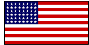
48-star flag (6 rows, 8 stars in each row)

On all major holidays my parents would fly the American Flag in front of our house. The 48-star flag had been the official flag since 1912 when Arizona and New Mexico were admitted to the union. When Alaska became the 49 th State (and feeling very patriotic) my parents wanted to retire their 48-star flag and replace it with the new the 49-star flag. But there was a dilemma: Since Hawaii would soon be admitted and the flag would change to 50-stars, why not wait a few months and replace the 48-star flag with the just- announced 50-star flag? They reasoned that if they purchased a 49-star flag it would soon become a collector's item since most people would wait for the 50-star flag to become official.